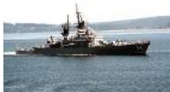
1992—Seattle Sea Fair Festival