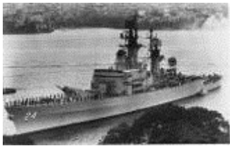
1968—Entering Sydney Harbor