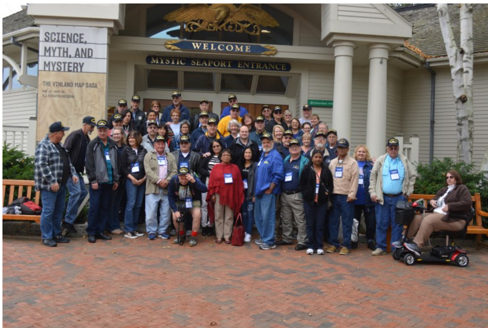
USS Reeves Providence Reunion - Mystic Seaport Tour attendees